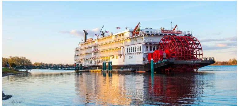
Ship: American Empress